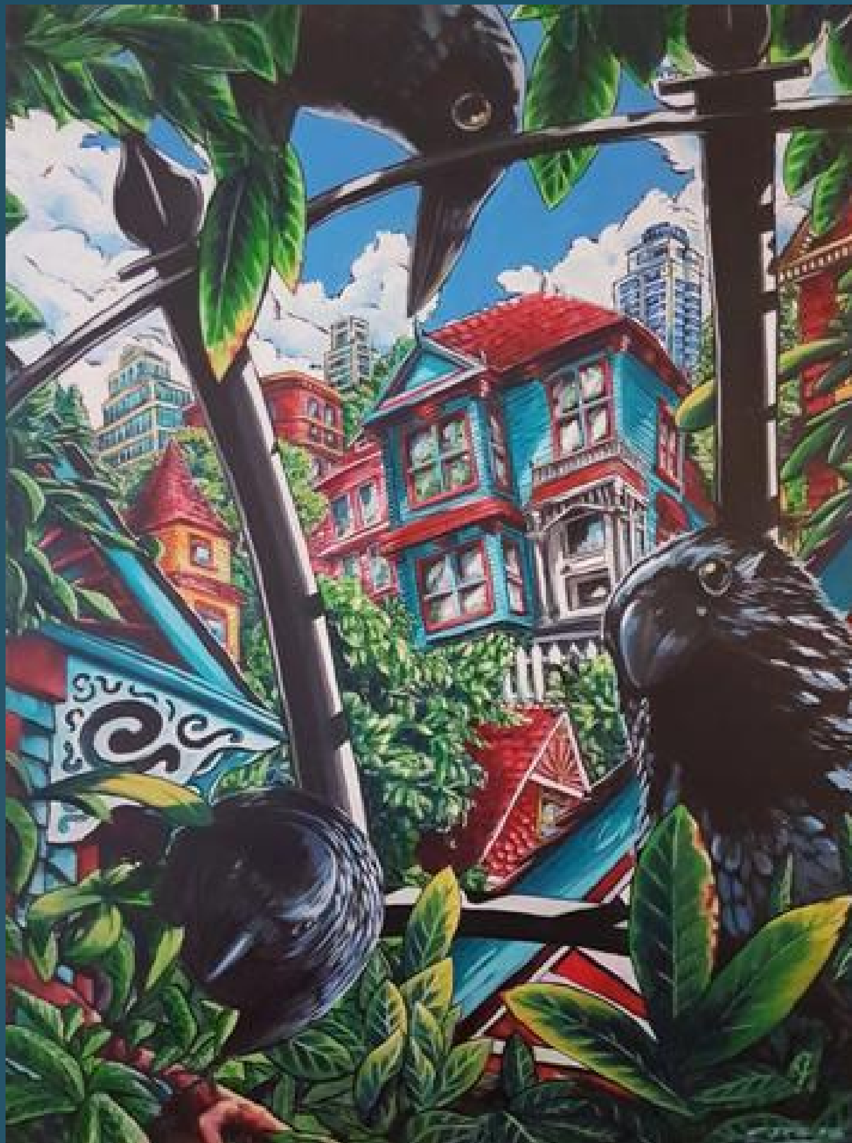
Photo of acrylic painting "From the Mean Streets of Fernwood" by Cory Scott. Painting description by Cory Scott: A look at the developing neighbourhood of Fernwood, from its Victorian heritage houses to the modern highrises on the fringes of downtown, and the murders of crows that have called this neighbourhood home through all those generations.

Action item: Ride over to Walnut Street and see if you can spot a couple of crows in mid-caw-conversation.