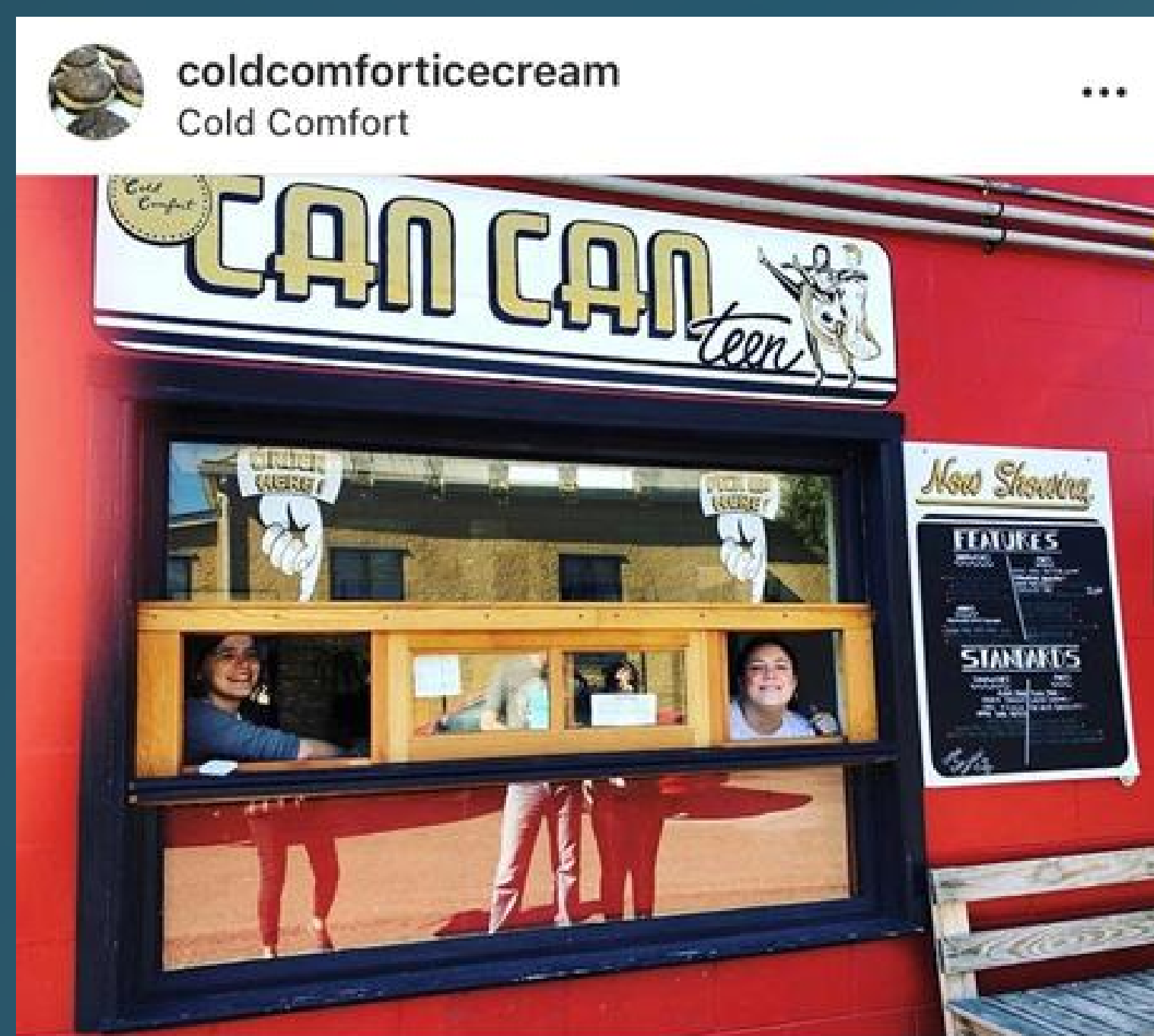
Photo of Cold Comfort Ice Cream's New Can Canteen by/from Cold Comfort Ice Cream's Instagram Page.

The story of Fernwood and North Park's favourite neighbourhood ice cream shop begins with the owner's personal stories of determination, creativity, and a deep love of ice cream. Before the owner of Cold Comfort Ice cream decided she wanted to open an ice creamery in the neighbourhood of her late teens/early 20's, she had explored many other career paths including "cooking apprenticeship, working in a library, camp cooking in gold mines in the artic, caregiving for the elderly, and booking bands in Europe." Today, this successful ice cream shop makes a high-density, high-quality ice cream and ice cream sandwiches with gluten-free and dairy-free options, as well as organic ingredients such as local fruits, herbs, eggs, and other items.