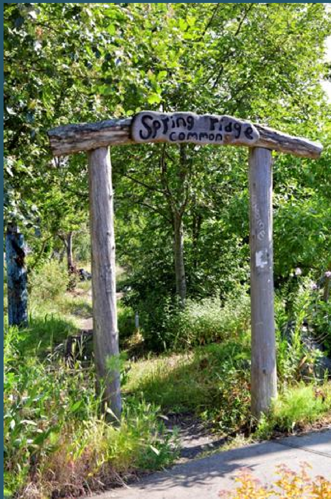
Photo of Spring Ridge Commons.

Action item: Ride over to the Spring Ridge Commons and explore the many plants growing here. What plant species can you see? Hint: Check out the many little signs that indicate the name of the species growing there.