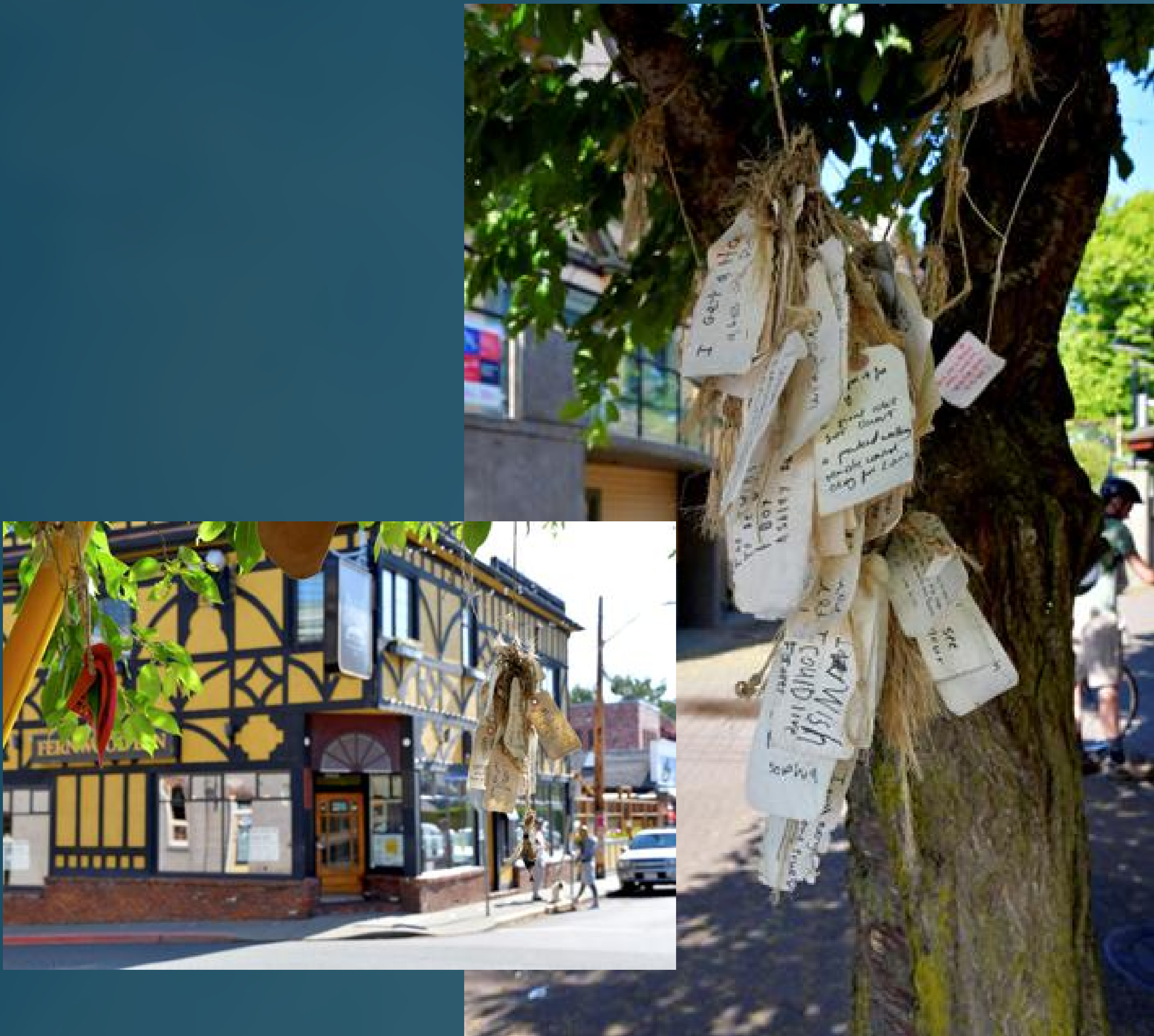
Photos of Fernwood Wishing Tree and Fernwood Inn.