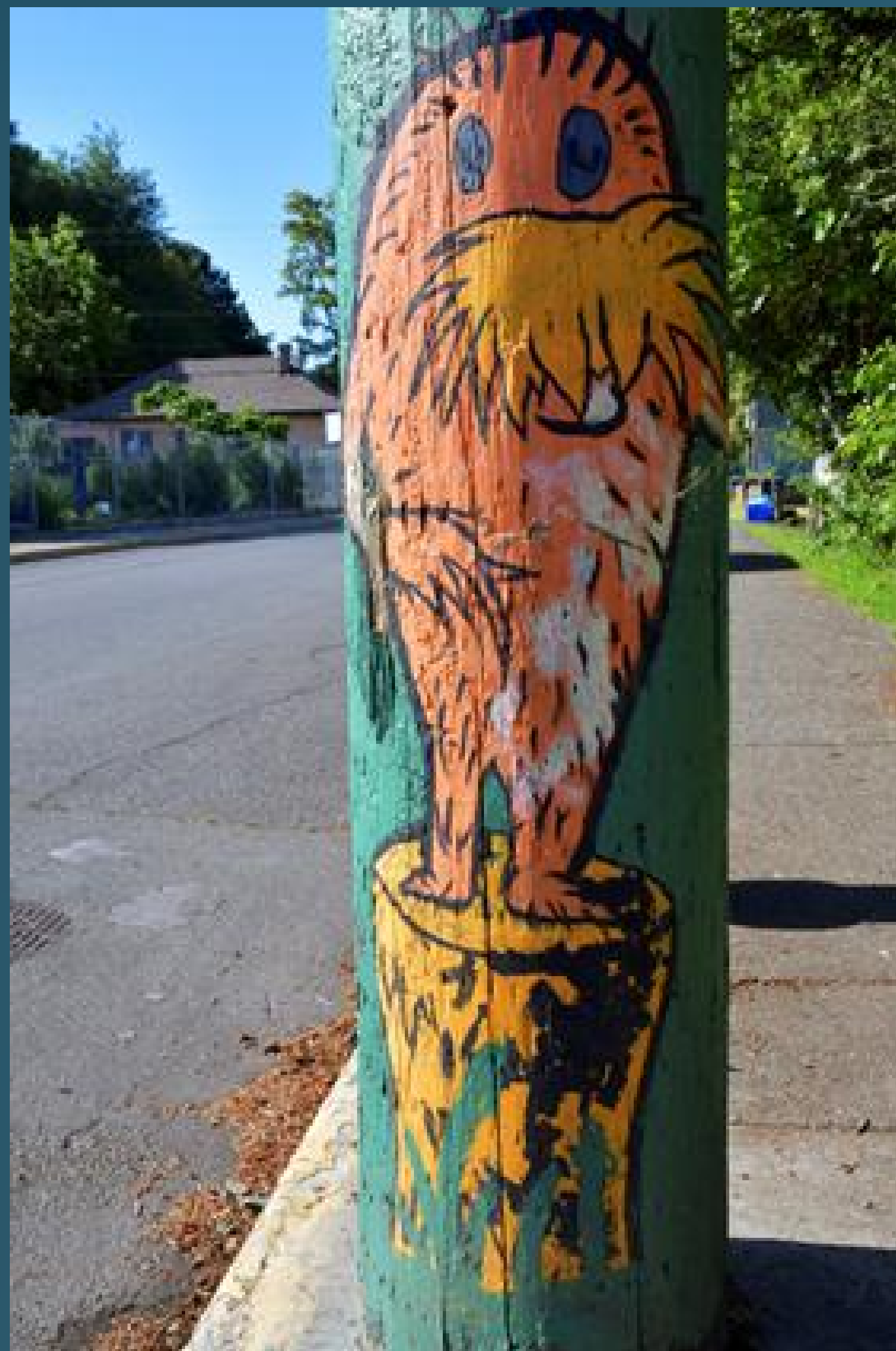
of Dr. Seuss Painted Telephone Pole on Chambers Street.

Action item: Explore the many painted telephone poles around Fernwood. Find your favourite painted telephone pole and take a photo!