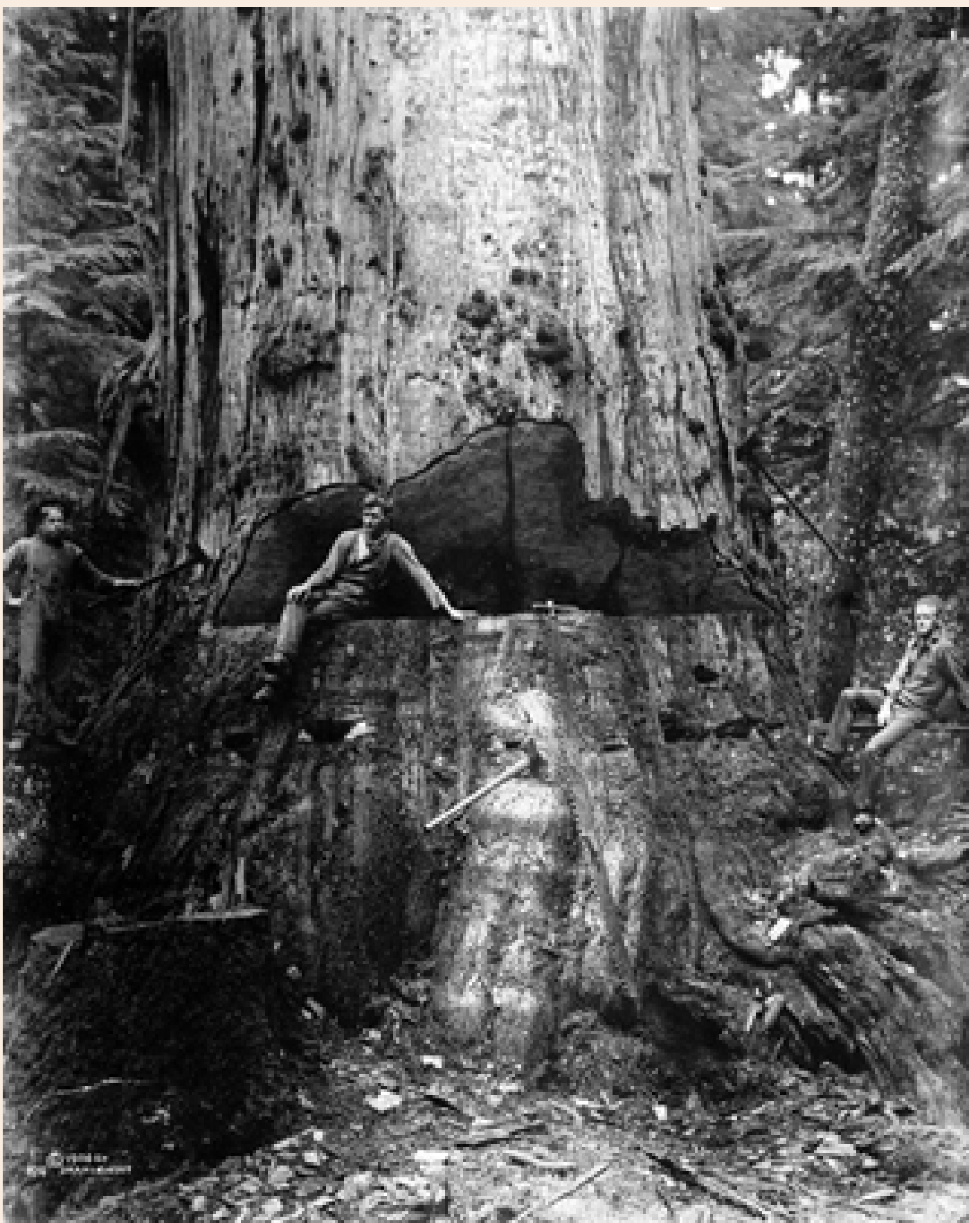
An early photo of Pacific Northwest logging of large cedar trees.

Cycle up a local hill which you’ve found daunting in the past. Since Camosun is near Mt.Tolmie, cyclists may wish to bike up to the top and enjoy a nice view and pleasant ride down the other side (remember to make sure your brakes are in working order!). Other nearby hills to conquer include Cedar Hill Cross Road between Richmond and Gordon Head Road, and Foul Bay Road just south of Landsdowne Road. Take a photo once your ride has been conquered.