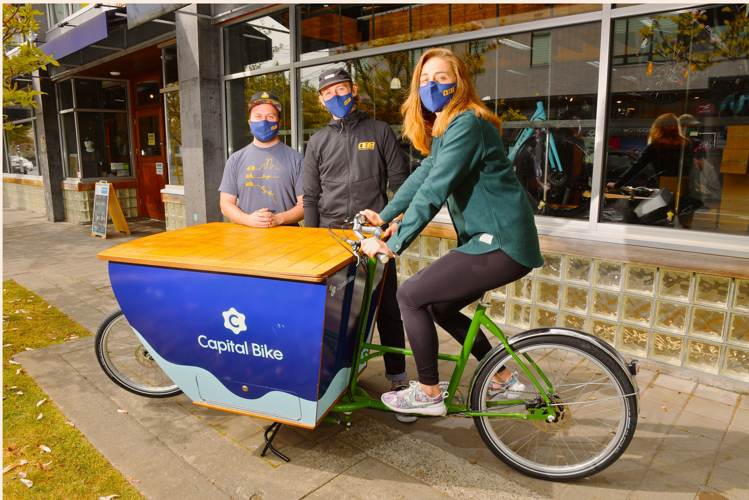
Photo of OBB staff on our Capital Bike cargo bike, by John Holland.

Located on Oak Bay Avenue, this beloved bike shop has been supporting cycling for nearly a century. This local shop carries all the latest and greatest in many categories of bicycles including electric bikes!